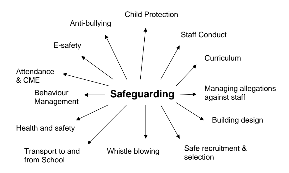
*Annex A: Safeguarding information for school and college staff, is a condensed version of KCSIE Part 1. It can be provided (instead of Part one) to those staff who do not directly work with children, if the governing body think it will provide a better basis for those staff to promote the welfare and safeguard children.

We will identify and provide opportunities for children to develop skills, concepts, attitudes and knowledge to promote their safety and well-being.